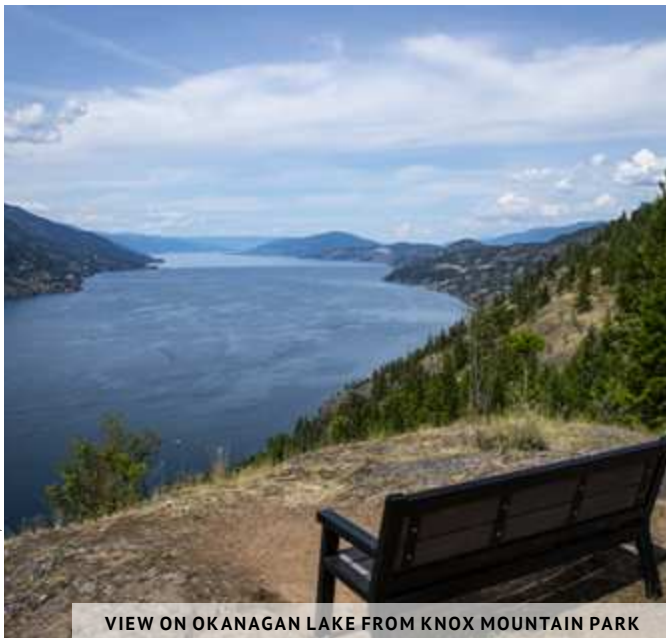
VIEW ON OKANAGAN LAKE FROM KNOX MOUNTAIN PARK