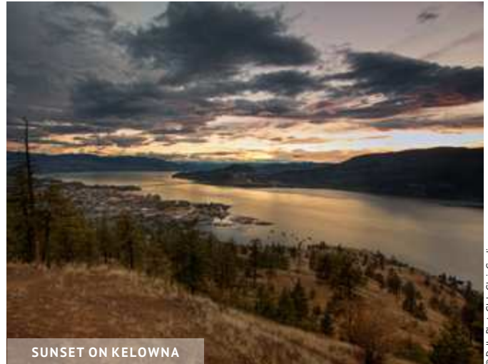
SUNSET ON KELOWNA