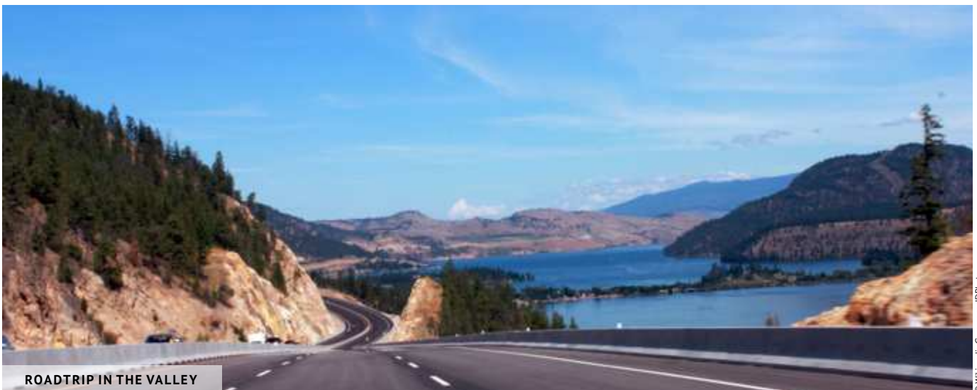
ROADTRIP IN THE VALLEY