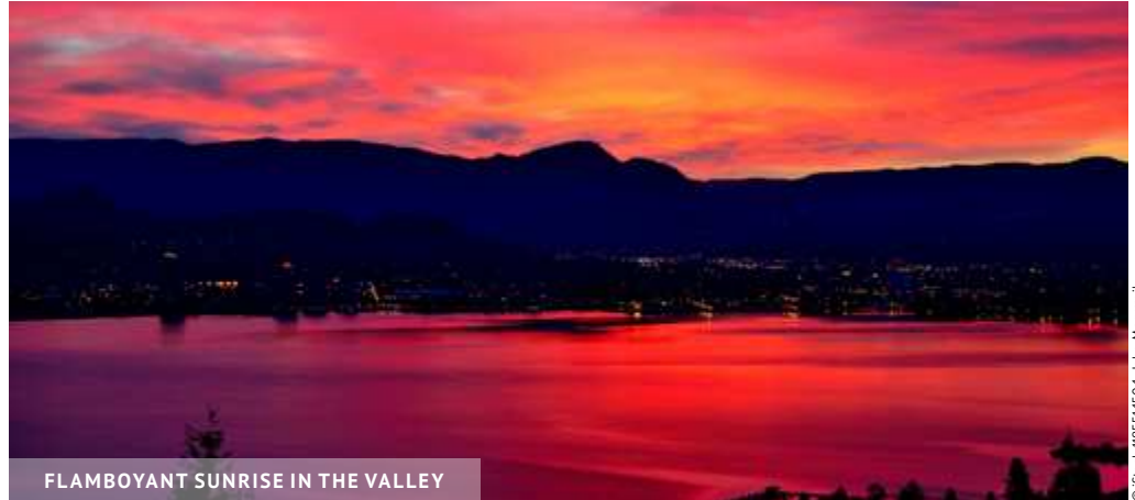
FLAMBOYANT SUNRISE IN THE VALLEY

Home to more than 120 wineries, the Okanagan Valley is the oldest and largest wine region in British Columbia. The Okanagan hosts four wine festivals, one each season of every year: there's always something to celebrate in wine country! www.thewinefestivals.com