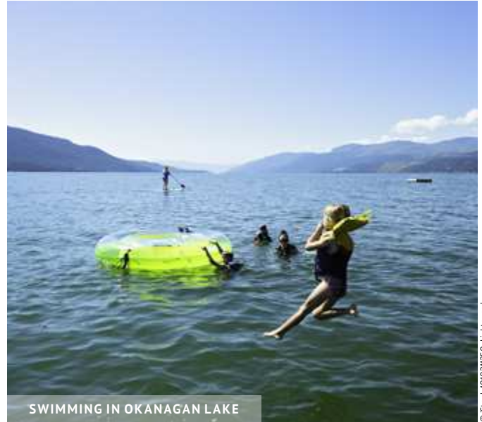
SWIMMING IN OKANAGAN LAKE