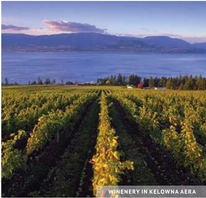
WINENERY IN KELOWNA AERA

450, KNOX MOUNTAIN DRIVE, KELOWNA WWW.KELOWNA.CA/PARKS-RECREATION/PARKS-BEACHES/PARKS-BEACHES-LISTING/KNOX-MOUNTAIN-PARK