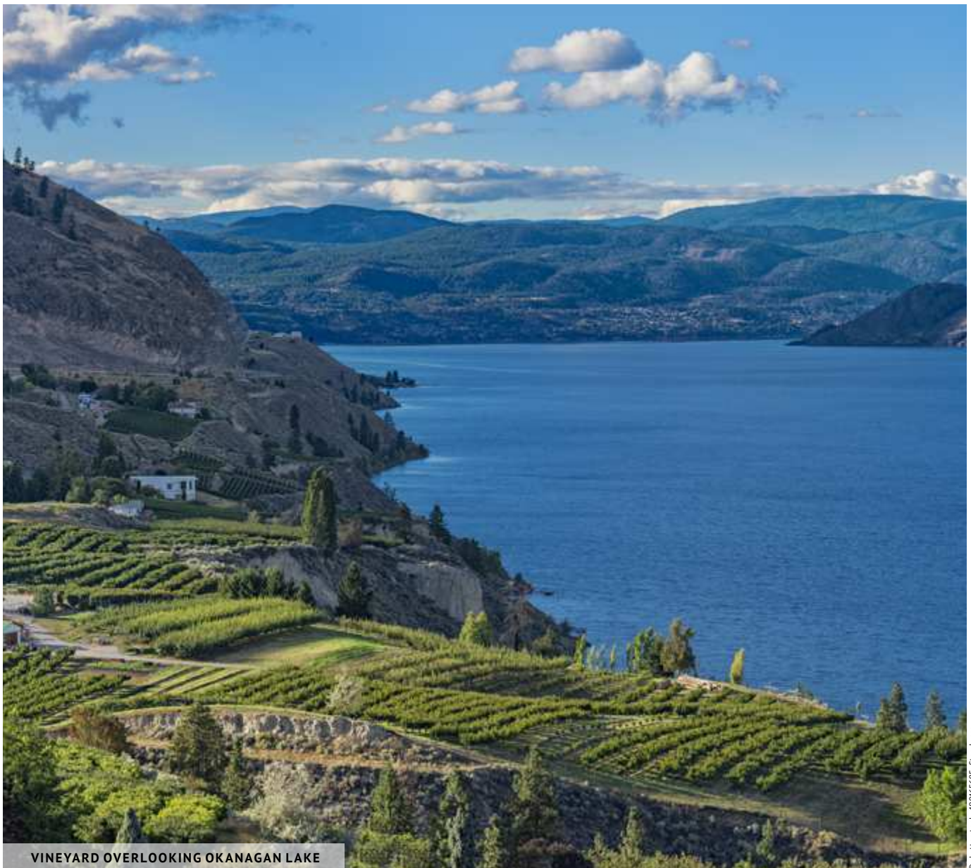
VINEYARD OVERLOOKING OKANAGAN LAKE