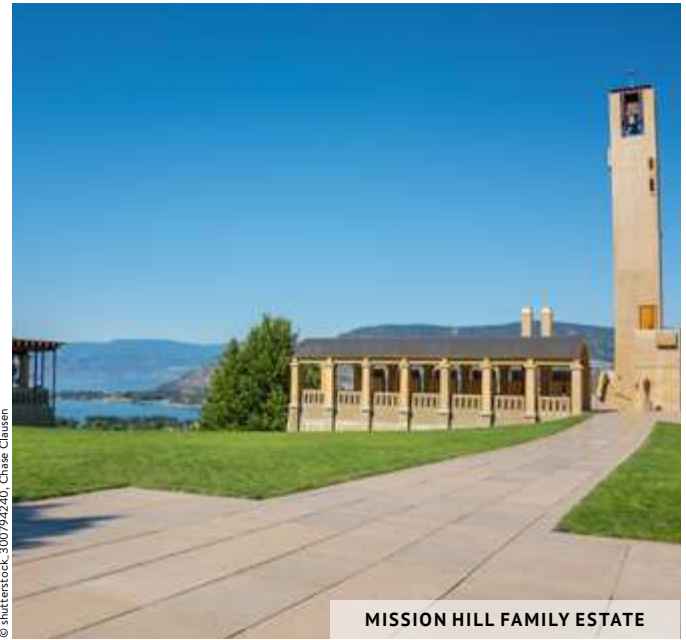
MISSION HILL FAMILY ESTATE